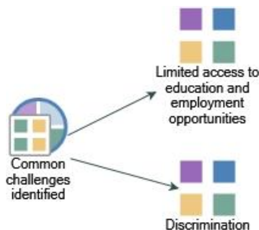
Figure 1. Common challenges identified

In Papua, women's involvement in the development process faces several complex challenges. However, women have great potential to act as significant change agents in advancing the region's development. Existing obstacles prevent Papuan women from making maximum contributions to their region's social, economic, and political development. Therefore, it is essential to address these challenges and encourage the active involvement of Papuan women in the development process to achieve sustainable and equitable progress throughout Papua.